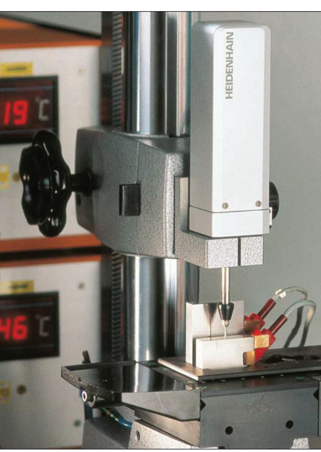
Calibration of gauge blocks