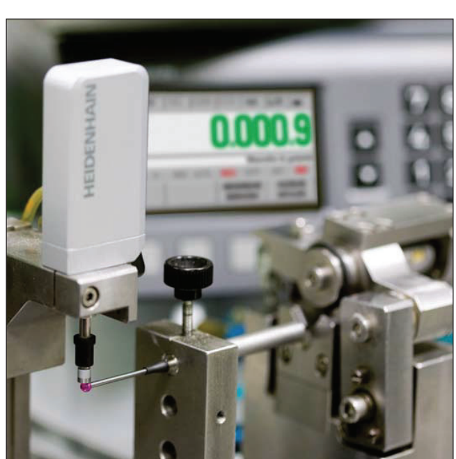
Inspection of styli